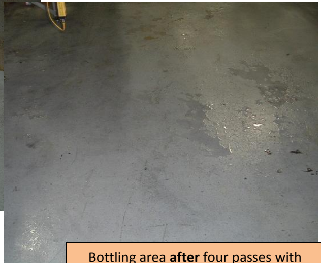
Bottling area after four passes with the chemical scrubber on day 1

By the 3 rd day, the bottling area floor has been scrubbed six times, but it appears that the chemically cleaned area is still not as clean as the ec-H2O area was after the first day's cleaning.