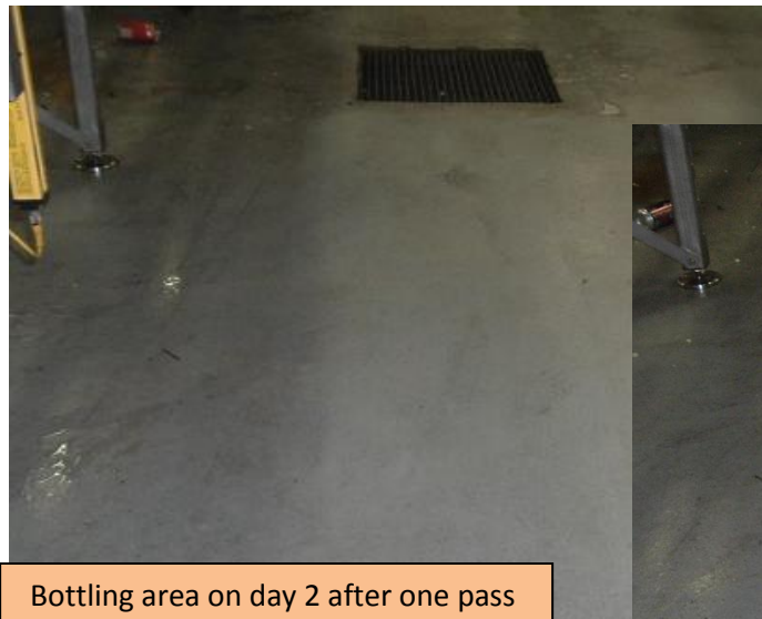
Bottling area on day 2 after one pass with the chemical scrubber

By the 3 rd day, the bottling area floor has been scrubbed six times, but it appears that the chemically cleaned area is still not as clean as the ec-H2O area was after the first day's cleaning.