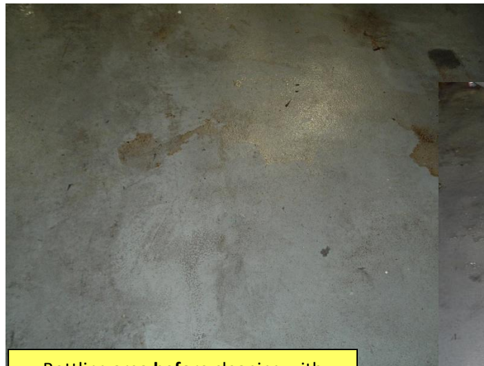
Bottling area before cleaning with chemical scrubber on day 1

Contrast that with the scrubbing method using chemicals. The floor pictured is in the bottling area, right next to the floor done with the ec-H2O scrubber.