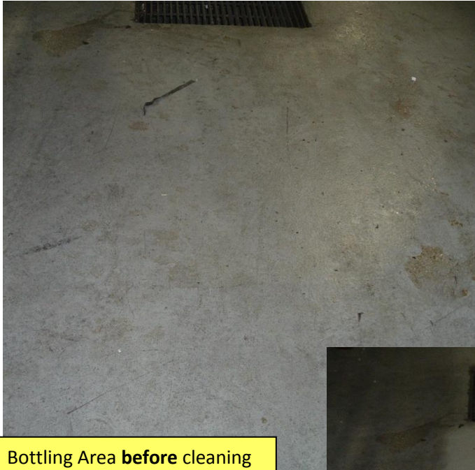
Bottling Area before cleaning

The testers and employees of the plant were very impressed by the performance of the ec-H2O scrubber. Given the nature of the residue on the floors, everyone was a little skeptical that water, even electrolyzed water, would be able to remove any soiling as effectively as a chemical. It was immediately apparent that those fears were unfounded – ec-H2O removed even the toughest greasy dirt quickly, leaving the concrete floors dry and residue-free.