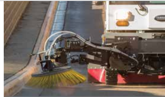
OPTIONAL VARIO SWEEPING BRUSH™

Optional Vario Sweeping Brush™ allows the Sentinel the ability to sweep on top of curbs, collect hard to reach debris from corners, around fixed obstacles and in congested areas for increased productivity and more effective sweeping.