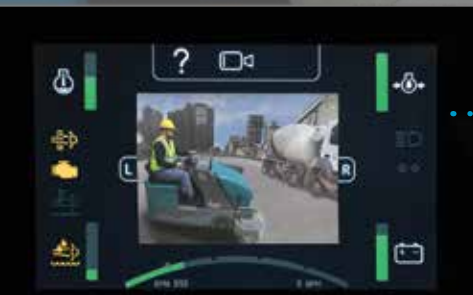
PERFORMANCEVIEW™ CAMERA SYSTEM

..... Safely monitor the side and rear areas of the machine with the PerformanceView™ camera system.